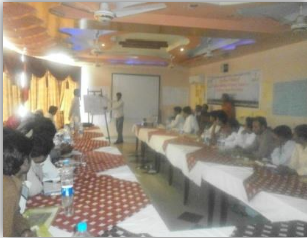
Capacity building of young volunteers