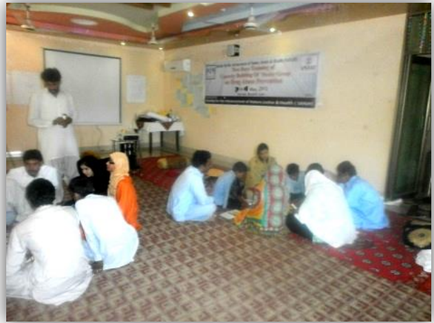
Training of Theater group