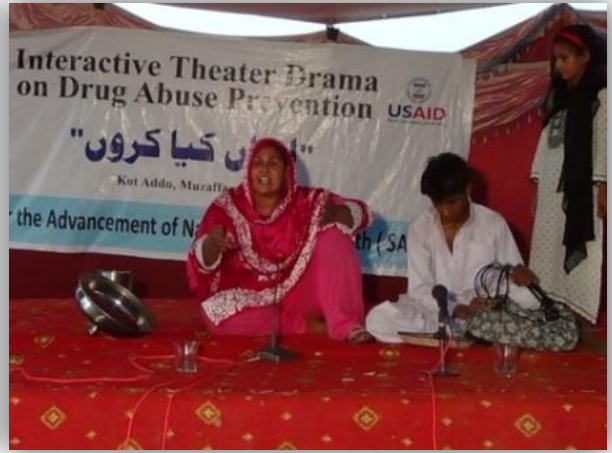
Gathering (Participants) of Theater Plays